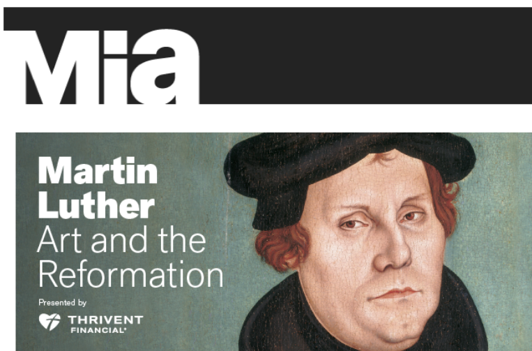
Exhibit opens 30 October 2016; Closes 15 January 2017.