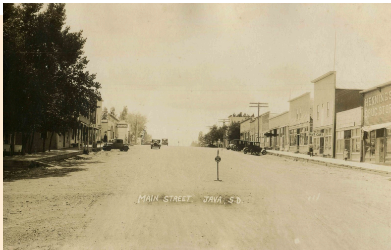
Java, SD

A native of Eureka, South Dakota, Duane often visited Walworth County as a child. The book contains over 200 postcard images, and this program is sure to be informative and entertaining.