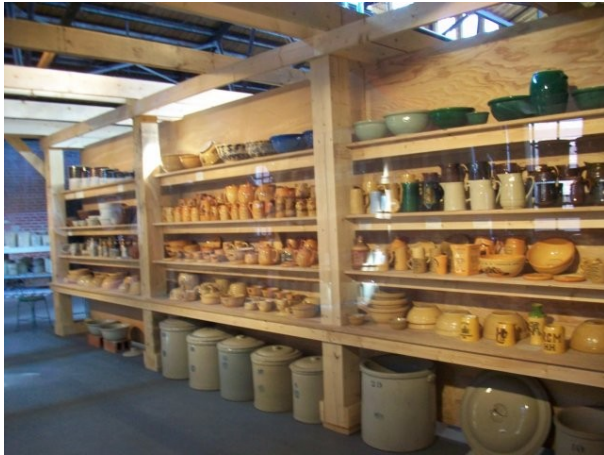
Samples of items made and sold throughout Canada by the potters located in Medicine Hat

During my time in the library, I found it rewarding to help numbers of people with their search but sometimes such volunteer work has its reward. I met a lady who was born and reared in Medicine Hat. As she grew to adulthood, she married and lived elsewhere in Canada. As she and her husband retired, they longed to move back to Medicine Hat. With a little help, she's now busy learning about her heritage. As we talked, she told me of a POW camp that existed at the site of the present rodeo grounds. The POW camp housed some 18,000 German prisoners during WW II. She told me that Medicine Hat was only 10,000 in size during those years and of some of the fears and happenings at the site including several murders within the camp and the results and justice that happened later as the war came to an end.