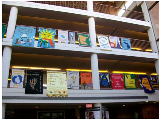
A portion of the banners on display in the convention hall

obituaries that have been digitized and are online for members to use. These are collected by volunteers and in some cases are translated from old German newspapers.