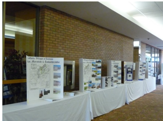
Displays available for viewing in the convention hall

A "Village Night" took place Thursday evening where individuals had an opportunity to meet individuals who had connections to small communities that their ancestors were from. I have always found this of particular value as I meet new people and it helps to build a friendship that goes beyond the time spent at the convention.