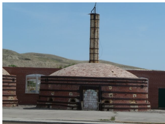
Madalta's surviving oven used to make a variety of products sold throughout Canada

Driving around Medicine Hat, one also sees some historic places less connected to the German-Russian heritage but certainly where German-Russians visited and worked. One such place was the Medicine Hat Clay Industries. This pottery is now the only place where one can tour the remains of what once was Medalta Potteries ( www.medalta.org ). What I saw reminded me much of Minnesota's own Redwing Pottery.