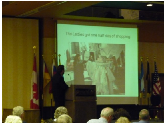
Convention Speakers: One of the local Hutterite Colonists discusses the difficulties his ancestors experienced before immigration to Canada from South Russia