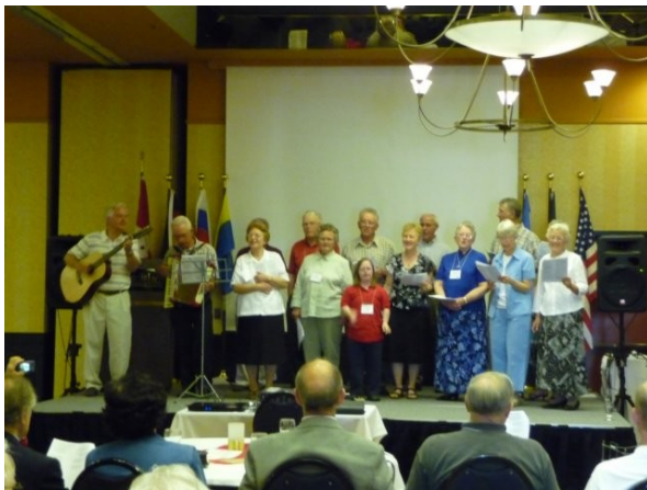
Entertainment was provided by a local family who had a reunion while at the convention

During one of the lunch meetings, the North Star Chapter was honored with receiving two certificates of appreciation. They are “for support above and beyond AHSGR Membership Recruitment campaign for 2008-2009” and for “a Thank You for the North Star Chapter’s financial support to the Reach Out Campaign during 2008-2009.”